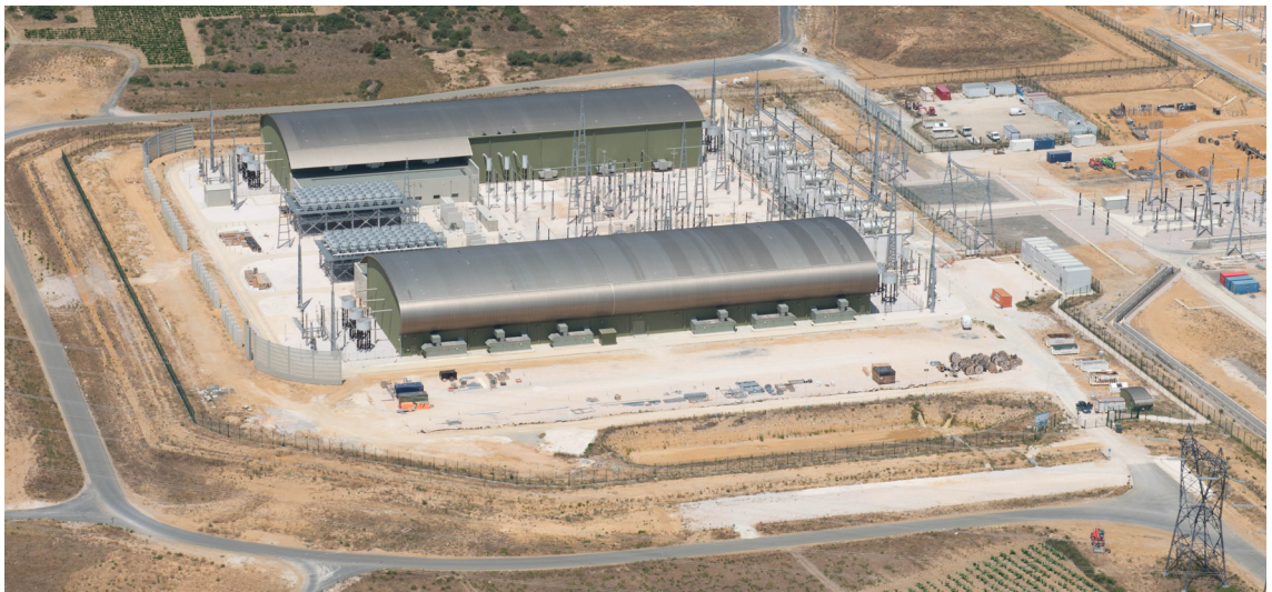
Baixas converter station

To make this possible, Inelfe has chosen the most advanced technology available today and which has already been the focus of attention of many experts around the world, due to the advantages it represents in electricity grid management.